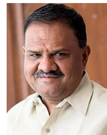
Honorable Shri. Satish Bhanudasrao Chavan