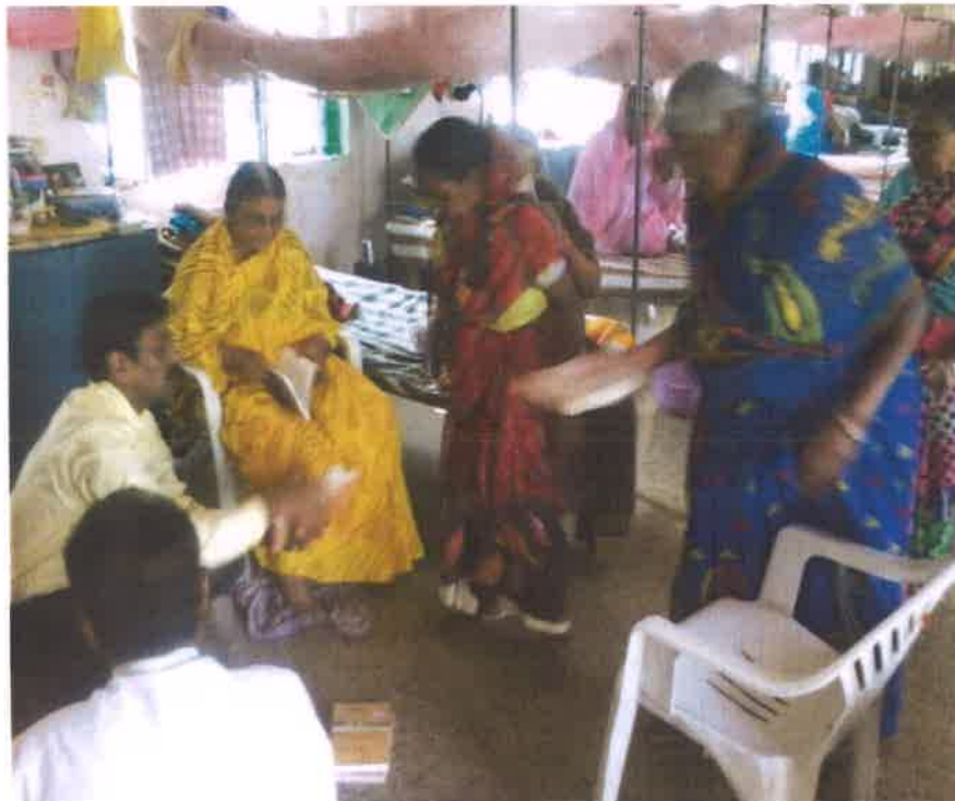
Mobile Library Service For People Staying in Old Age Home (Vrudhashram) Feb-2016