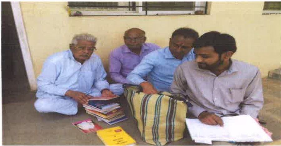
Mobile Library Service For People Staying in Old Age Home (Vrudhashram)