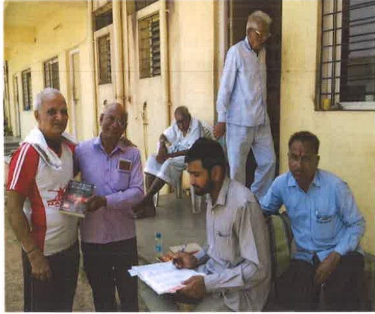
Mobile Library Service to Matoshri Vrudhashram at Kanchanwadi