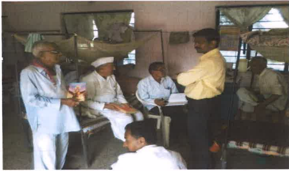
Mobile Library Service to Matoshri Vrudhashram at Kanchanwadi