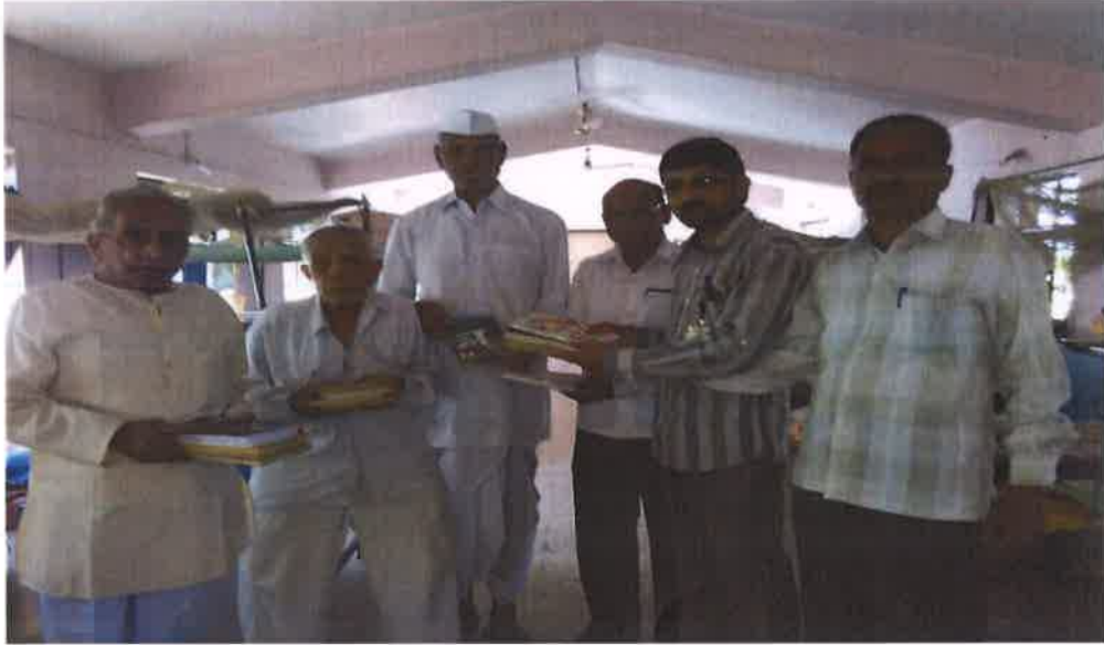
Mobile Library Service to Matoshri Vrudhashram at Kanchanwadi