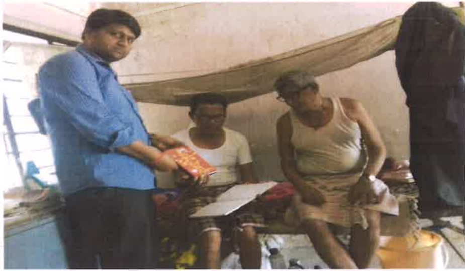
Mobile Library Service to Matoshri Vrudhashram at Kanchanwadi