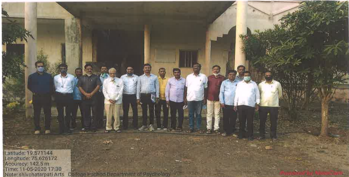
A group photo of the participants and resource persons