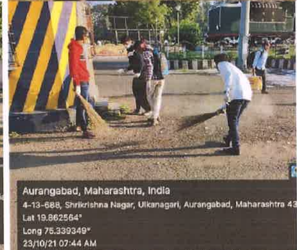
Clicks of volunteers from Deogiri College Aurangabad during Railway Station Cleaning.