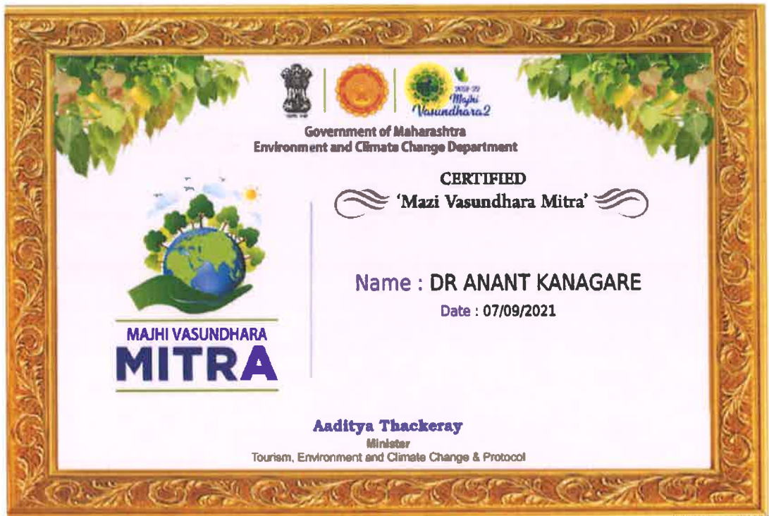
Sample copy of certificate received from Government of Maharashtra