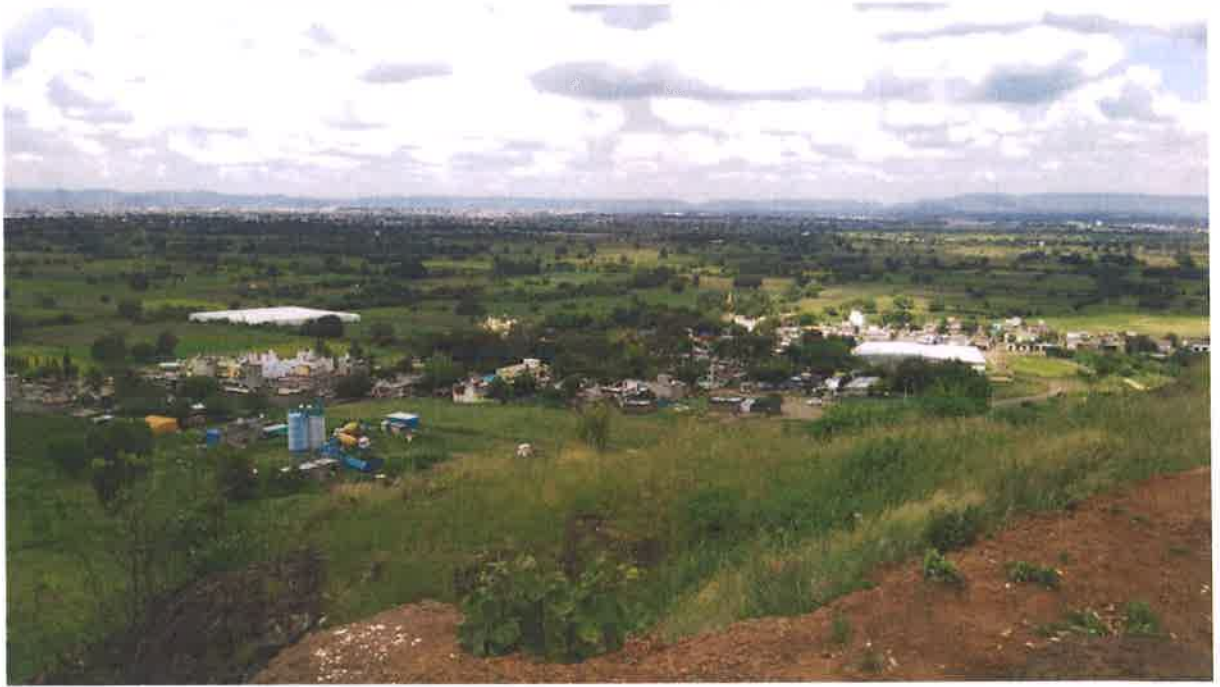
Top view of Bagtalab from hill.