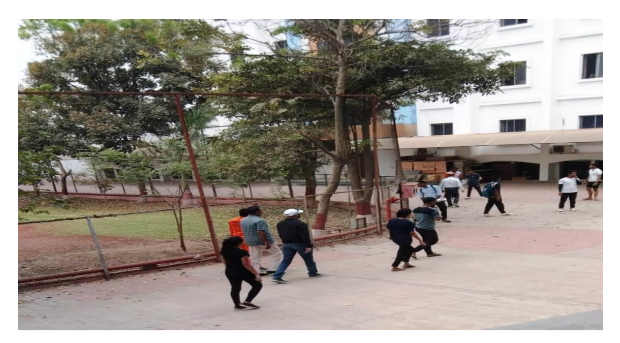
Peoples from nearby Area taking Benefit of College Walking Plaza