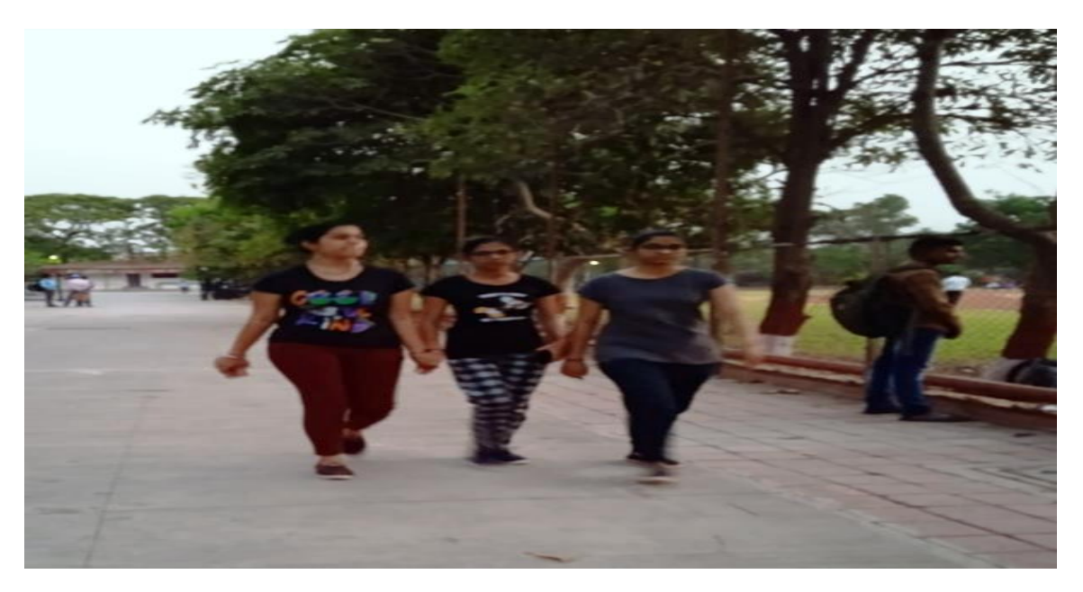
Peoples from nearby Area taking Benefit of College Walking Plaza