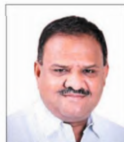
Hon. Shri Satish Chavan