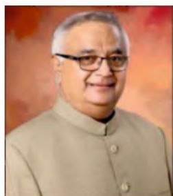
Hon. Shri Prakash Solanke